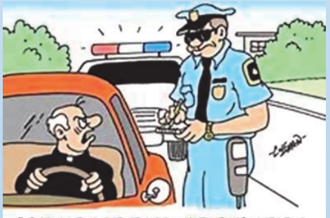
SHOW ME IN THE TEN COMMANDMENTS WHERE IT SAYS ANYTHING ABOUT SPEEDING!