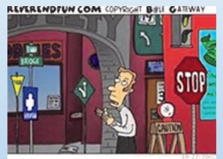
EVERY DAY I COME HERE AND PRAY FOR A SIGN, BUT I'M STARTING TO THINK THAT I'M NEVER GOING TO GET ONE

This falls under the category of, "Too wrapped up in ourselves, we never see what is around us."