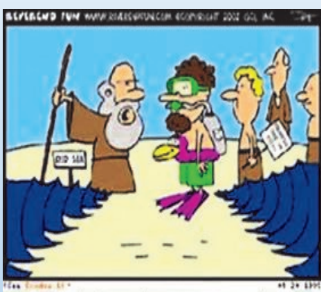
I think that you have some serious faith issues