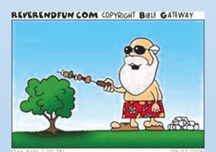
C'MON BUSH ... DO THAT BURNING THING