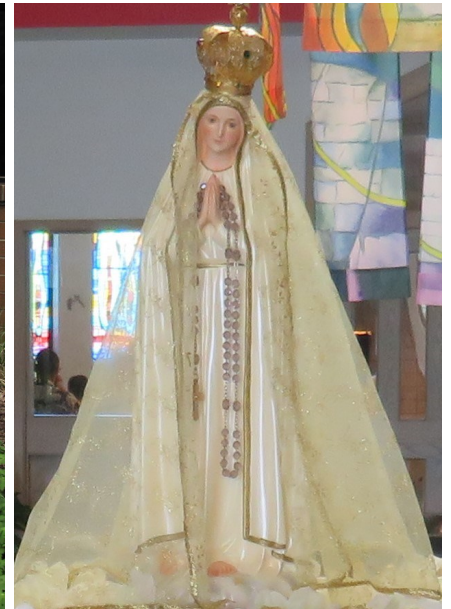
Mary in our Adoration Chapel