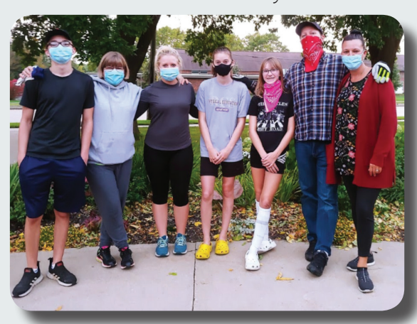
Thank you volunteers!